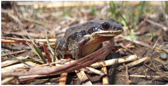
Boreal chorus frog, Pseudacris maculata