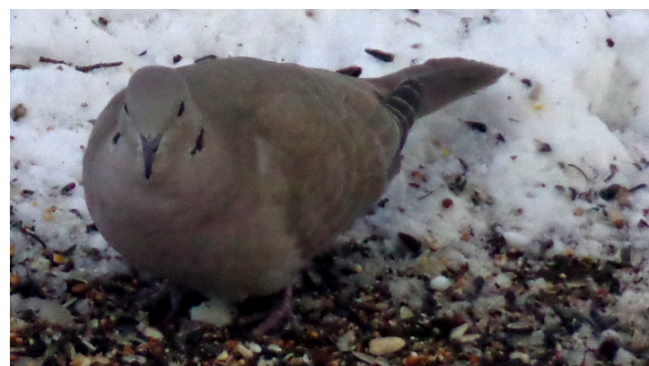
Eurasian Collared-Dove feeding in the snow on March 24. Note the squared off tail, the ends of the black collar that continues around the back of the neck, and the stouter body compared to the other two species.