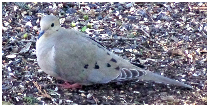
Ever-present and familiar Mourning Dove feeding under my hanging feeders.

I hope you will find all three species of doves at your feeders, soon, too. Maybe, too, I will get a picture of all three of them feeding together. Ah, another goal worth looking forward to enjoy.