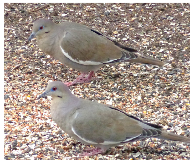
Most-recent arrivals – White-Winged Doves. Note the distinctive white wing-patch that is always visible as a narrow strip along the lower edge of the folded wing. The patch opens to a highly-visible white band on the wing when they fly.