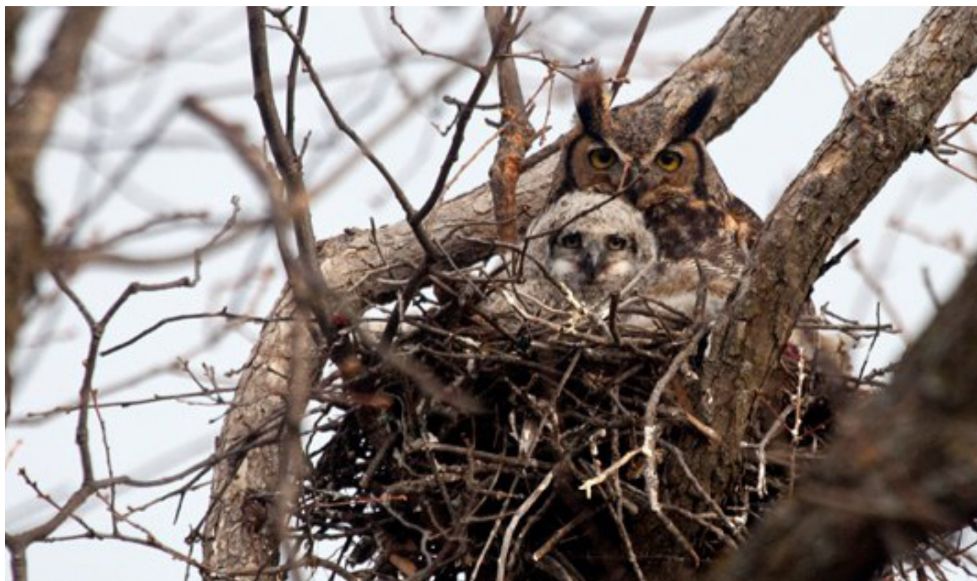
Great Horned Owl with chick.... April 6th.

The first published description of the Great Horned Owl was made in 1788 by Johann Gmelin. It was first seen in the Virginia colonies, so its species name was created from the Latinised form of the name of this territory (originally named for Queen Elizabeth I, the “Virgin Queen”). Great Horned Owls are sometimes known as Hoot Owls, Cat Owls or Winged Tiger.