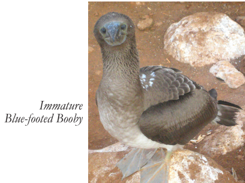
Immature Blue-footed Booby