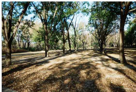
The long corridor of pecan trees and shadows in October.