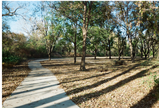
Linear Trail approaching Fair's Stand.