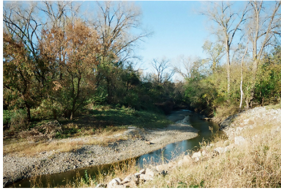
Wildcat Creek winds to the north of Fair's Stand.

cross forest gaps. The spread of pecan, acorn, and beech mast by jays and crows contributes to biodiversity and longevity of wooded landscapes. If you are lucky enough to catch the crows at breakfast in Fair's Stand, remember that you are privileged to witness an ecological process as old as the Flint Hills.