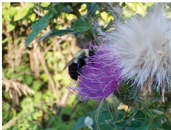
Common Eastern Bumble Bee ( Bombus impatiens ) wallowing in the inflorescence of a Tall Thistle ( Cirsium altissimum (L.) Spreng).

Check out Austin's Blog Birding Big Life .