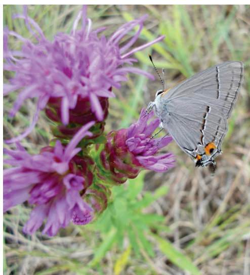
Grey Hairstreak Butterfly ( Strymon melinus ) collecting it's nectar from a Dotted Gayfeather ( Liatris punctata Hook).

The systems of nature fascinate me so much. To think of all the ways in which things in nature are interconnected, I don't believe it is possible. This just goes to support the notion that a small change can make a big difference. We as humans need to take this into consideration when we decide to develop lands to fit our needs. What could we be taking away from nature? What systems are we interrupting? How can we help to support the systems that we are destroying once we do? These are just some of the questions that I want answered. This planet isn't only ours. We are just a small part of a very large system.