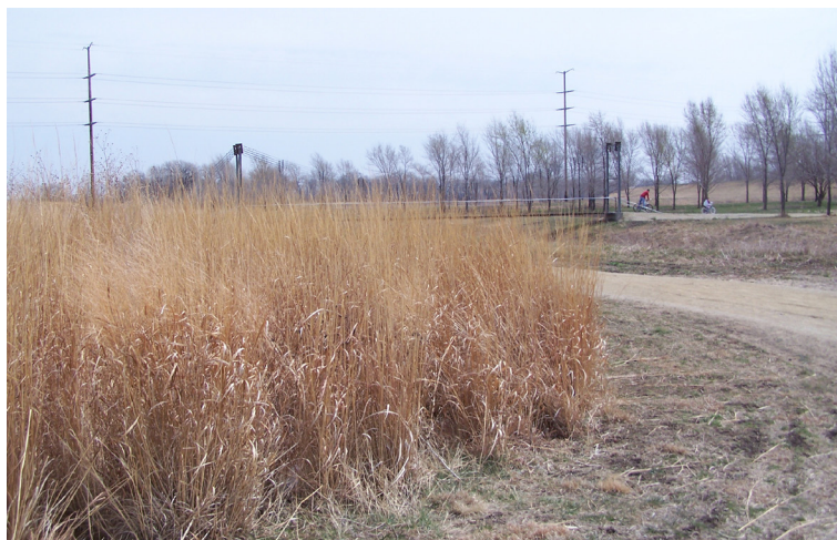
Prairie - Northeast Park, suspension bridge in background, connecting to Linear Trail.