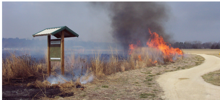
Cecil Best Birding Trail