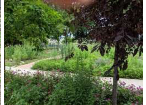
Alsop Bird Sanctuary - 17th and Laramie